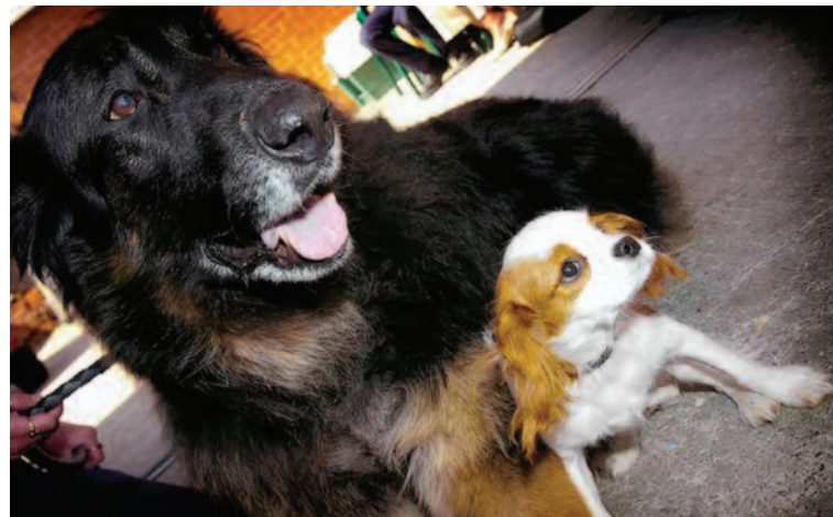
Leo and Ellie

The plight of King Charles spaniel pup Thank you to everyone who responded