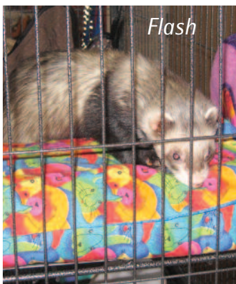
Flash earlier this year examining his new bed