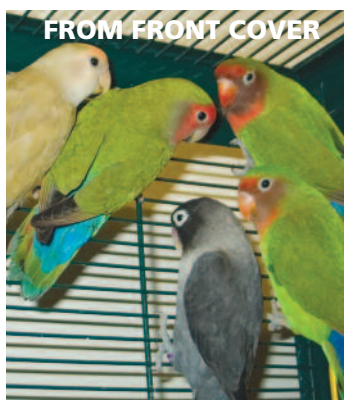
FROM FRONT COVER

You've certainly got to 'lovebirds' to put up with 26 of them chattering away non-stop! Good job then, that most of us in the Centre think they are wonderful. Actually we have rehomed almost all of the twenty six love birds we got - yes, that right, twenty six! the story started when the RSPCA asked us casually