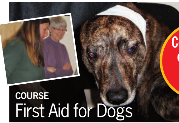
COURSE First Aid for Dogs