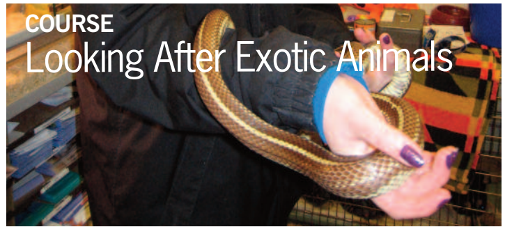
COURSE Looking After Exotic Animals