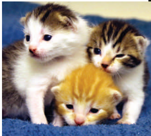
The 3 kittens that were left in a shoe box along with their Mum Minnie.