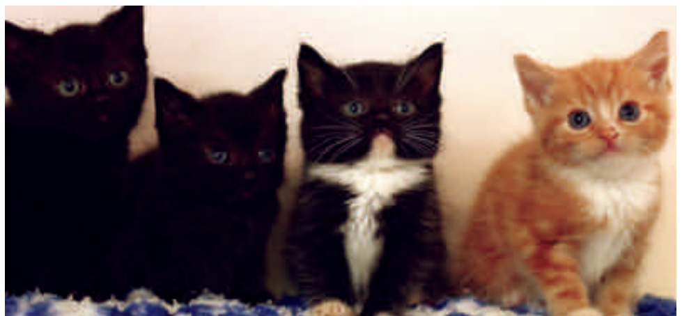
Abandoned by the young man who kept changing his story.

These are just a few examples of the cats and kittens we have had to take in. We have had around 100 kittens in this year that have either been dumped, or picked up by the inspectors. If only the queens to these kittens had been neutered.